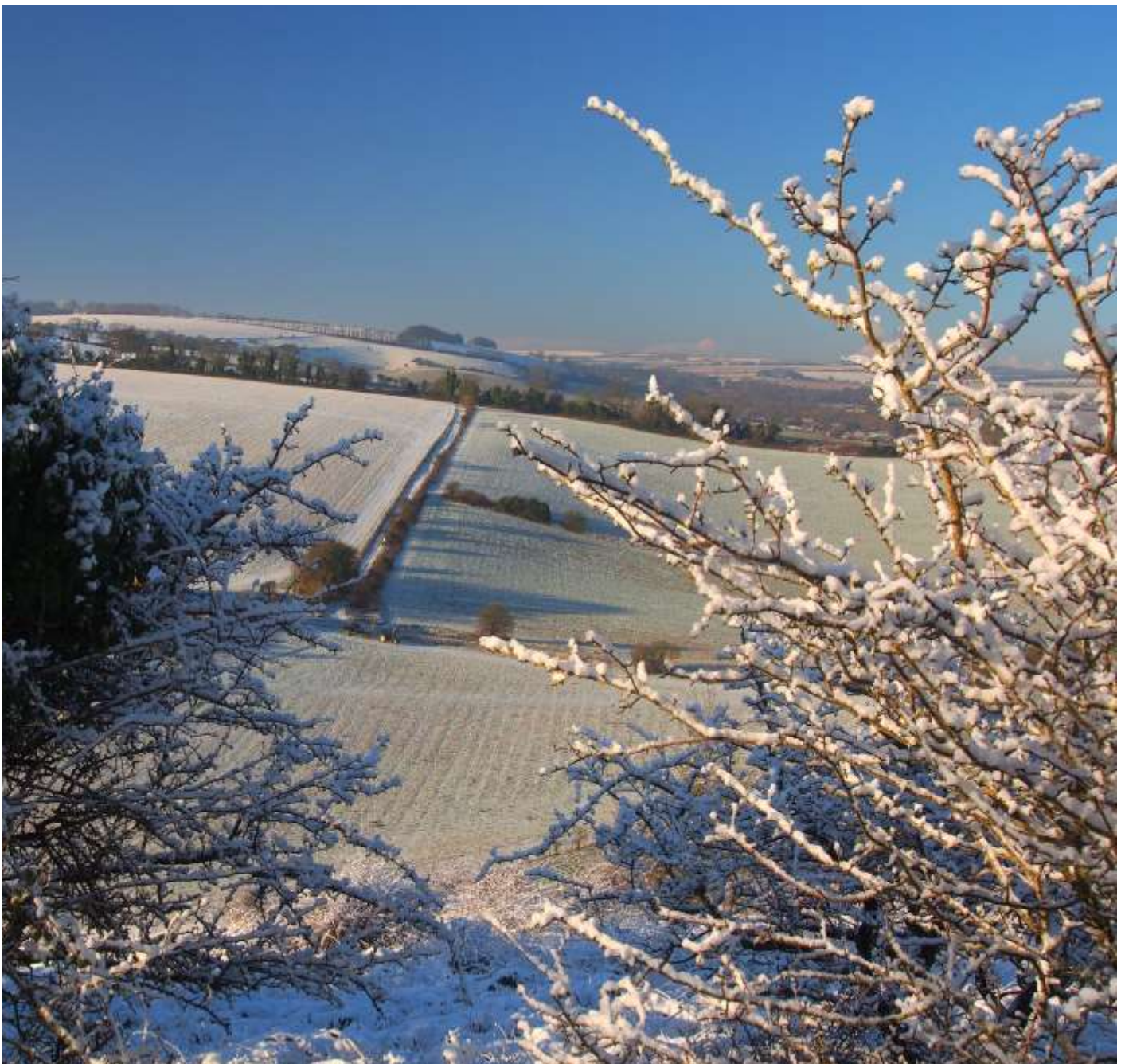
Snow above Bishopstone